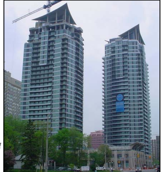
Two new apartment towers in the City Centre Planning District.

As of January 1, 2004 there were 50 applications for 6,639 residential units in process that were not endorsed by City Council. Proposed apartments made up 50% of unendorsed application units, followed by 19.5% each for townhouses and detached, and 11% semi-detached dwellings.