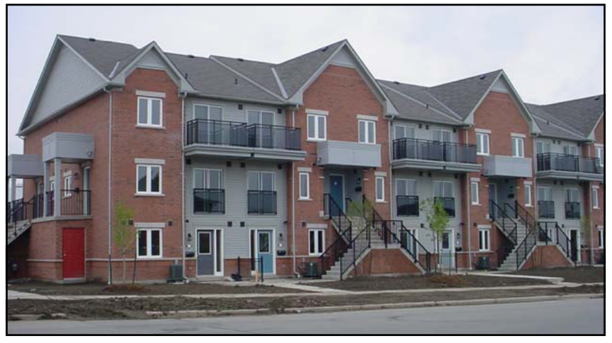
Built in 2003, the Heritage Hills development is a 92-unit stacked condominium townhouse complex located at the southwest corner of Eglinton Avenue West and Guildwood Way.

The committed category is comprised of 23,740 residential units, or 9.2% of the City's residential capacity and 55.1% of vacant residential land capacity. Approximately 83% of those committed units (19,740) are apartments, of which almost half